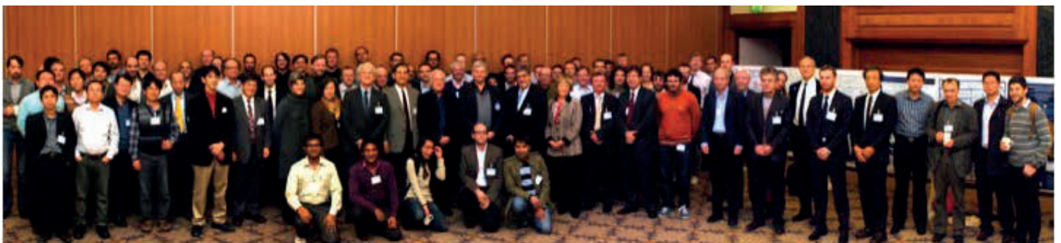
IZEST 2012: Laser Ascent to High Energy Physics

ter Search, TeV Astrophysics. The last day was devoted to the applications of IZEST's ultrahigh intensity lasers, in nuclear medicine, proton therapy, nuclear waste control, detection and transmutation.