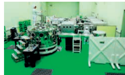
Figure 2. Petawatt interaction chambers at CoReLS

Researcher positions are available at CoReLS. An inquiry about job