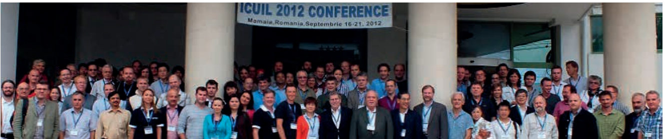
More than 170 participants gathered at the 2012 ICUIL Conference in Mamaia, Romania.

Tahoe, USA), 2006 (Cassis, France), 2008 (Tongli, China), 2010 (Watkins Glen, USA) conferences, the 2012 conference was another excellent opportunity for ICUIL to promote unity and coherence in the field of ultrahigh intensity lasers and their applications.