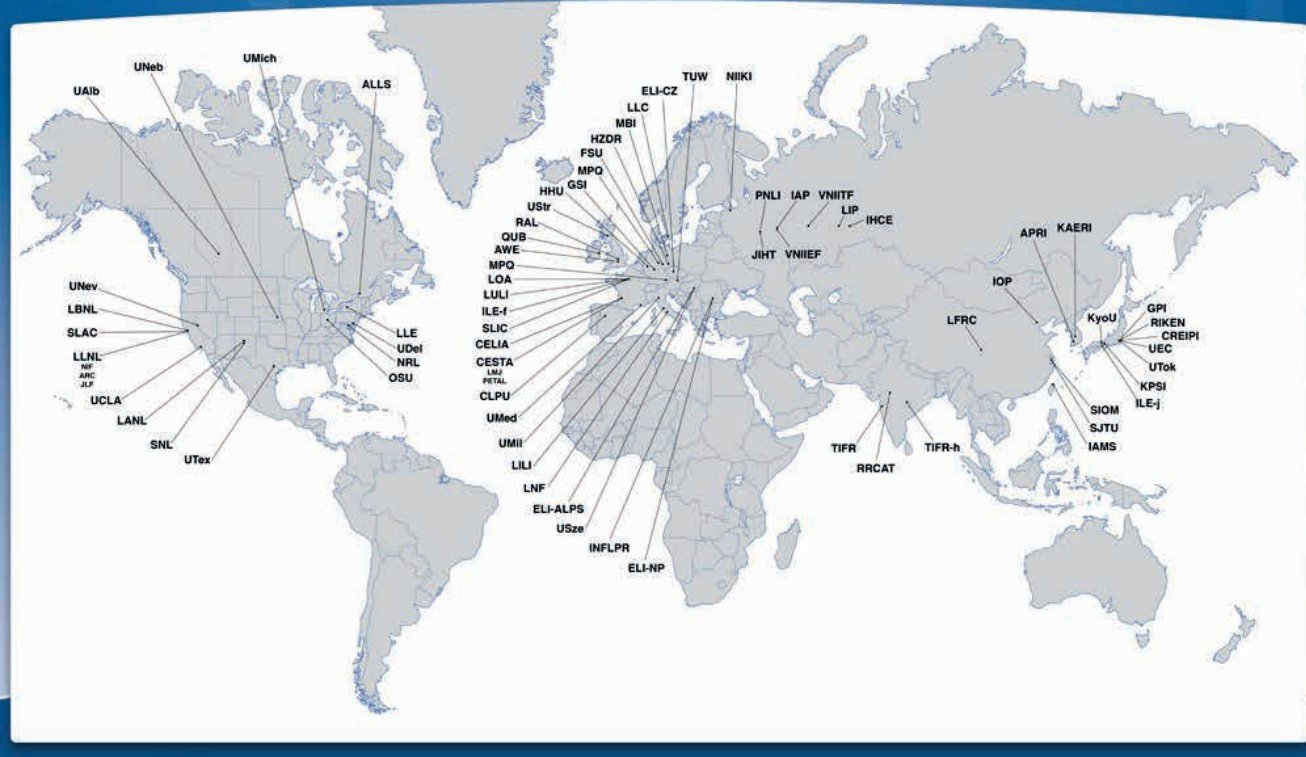
2012 World Map of High-Intensity Laser Facilities