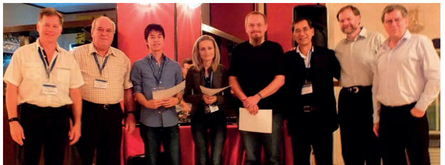
Young scientists (3rd, 4th, 5th), poster judges from ICUIL Board, and conference chairman (2nd)

The annual GA meeting was held on the last day of the 2012 ICUIL Conference in Rumania. The agenda consisted of member rotation, the 2012 and 2014 ICUIL Conferences, website development, the world map, fund raising, and laser infrastructure initiatives and collaborations such as ELI and IZEST. One of the features of the ICUIL website is an interactive world map which highlights the high intensity laser facilities around the world as shown below. A survey of the worldwide laser community has been conducted by ICUIL in an effort provide an accurate accounting of all existing and planned ultrahigh intensity laser capabilities. This survey has included input from more than 100 individuals representing every leading laser institution and facility and has gathered more than 300 pages of related materials. From these interactions and materials, a map of all existing and planned facilities that